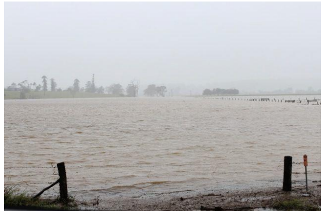
Figure 2: Flooding at Tamrookum 2013

This information is entered into the modelling software, calibrated against recorded flood events and flood maps are produced for the 1% AEP flood event and additional climate change factor is included.