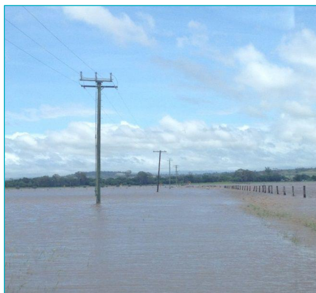
Figure 3: Flooding at Wilsons Plains Road, Harrisville 2013

the region, being the 1% AEP flood event. The climate change consideration (i.e. RCP4.5) has been incorporated within the Defined Flood Event shown on the Flood Hazard Overlay Map.