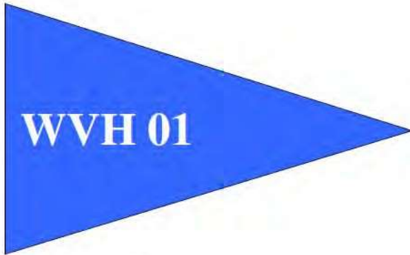
Water Point Direction Marker