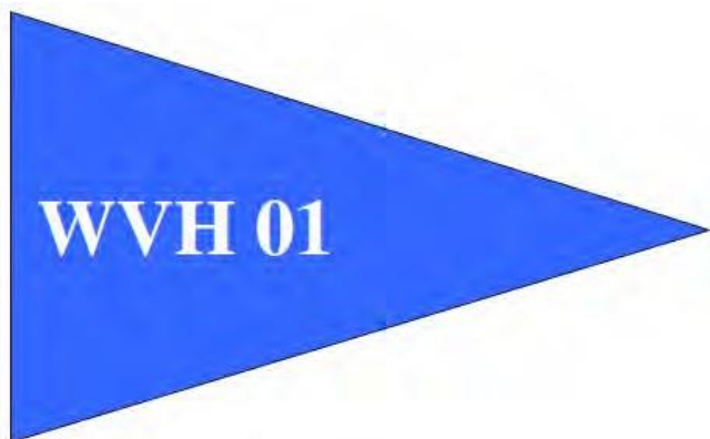
Water Point Direction Marker