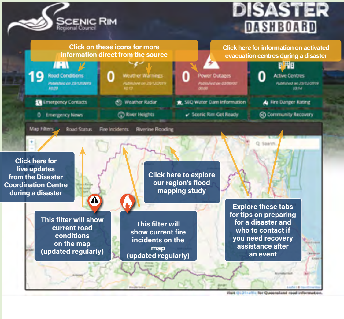
The Scenic Rim Regional Council Disaster Dashboard (pictured) enables you to stay up to date with weather warnings, road conditions and emergency information all in one place. Familiarise yourself with the Disaster Dashboard at disasterdashboard.scenicrim.qld.gov.au