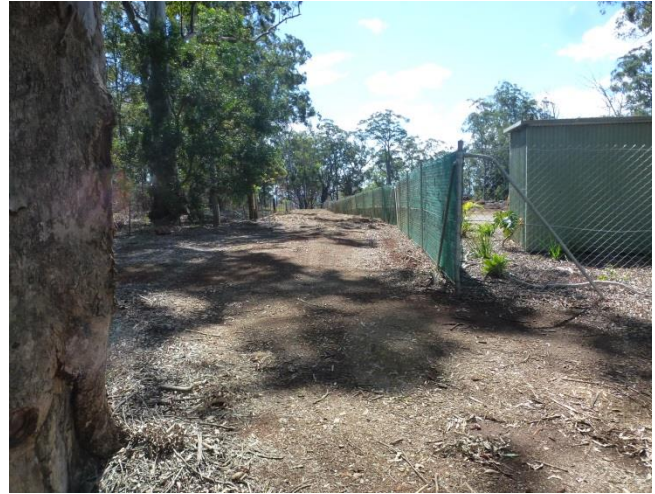
Figure 7 View towards the North-eastern corner of the entrance to Council's Waste Transfer Station showing where the Council-controlled road reserve ends and the fire trail through the National Park begins.