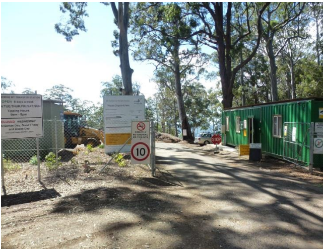
Figure 8 View towards the entrance to Council's Waste Transfer Station.