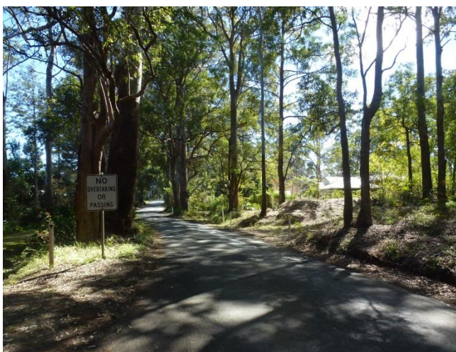
Figure 4 View looking North along Knoll Road where it narrows to provide for a large tree.