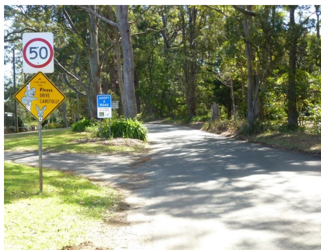
Figure 3 Depiction of the residential section of Knoll Road, showing the width of the road and large mature vegetation.