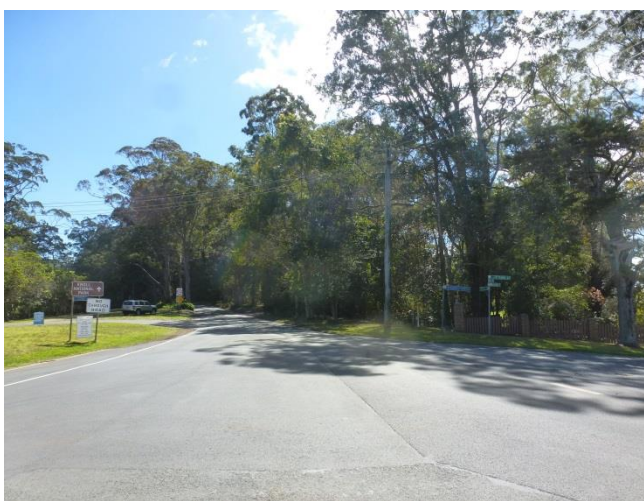
Figure 2 View towards the beginning of Knoll Road at the intersection with North Street, looking North.

The following photographs provide a visual analysis of Knoll Road from Main Street to the Waste Transfer Station.