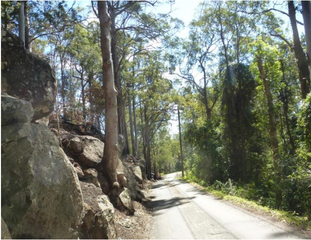
Figure 6 Depiction of Knoll Road looking North towards Council's Waste Transfer Station. This part of the road is subject to landslip during wet periods and often requires remediation.