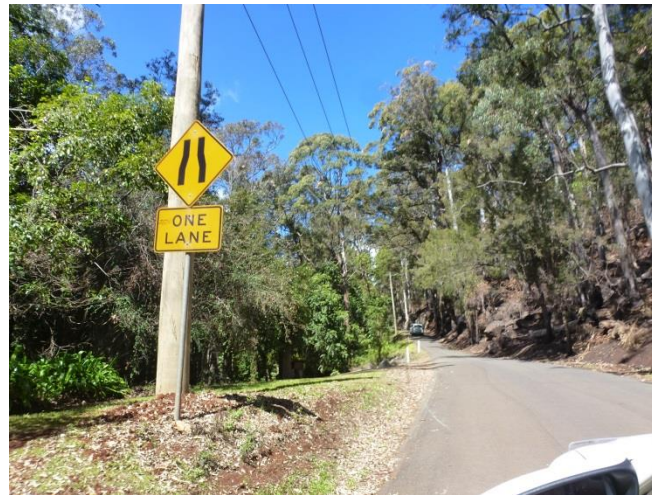
Figure 9 View looking South along Knoll Road from Council's Waste Transfer Station.